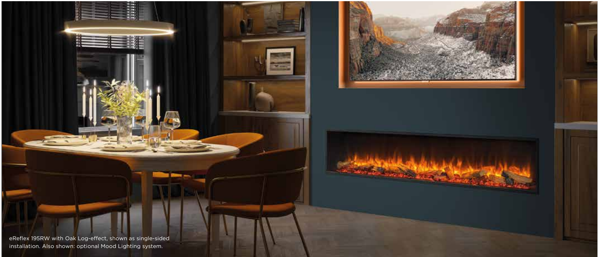
eReflex 195RW with Oak Log-effect, shown as single-sided installation. Also shown: optional Mood Lighting system.