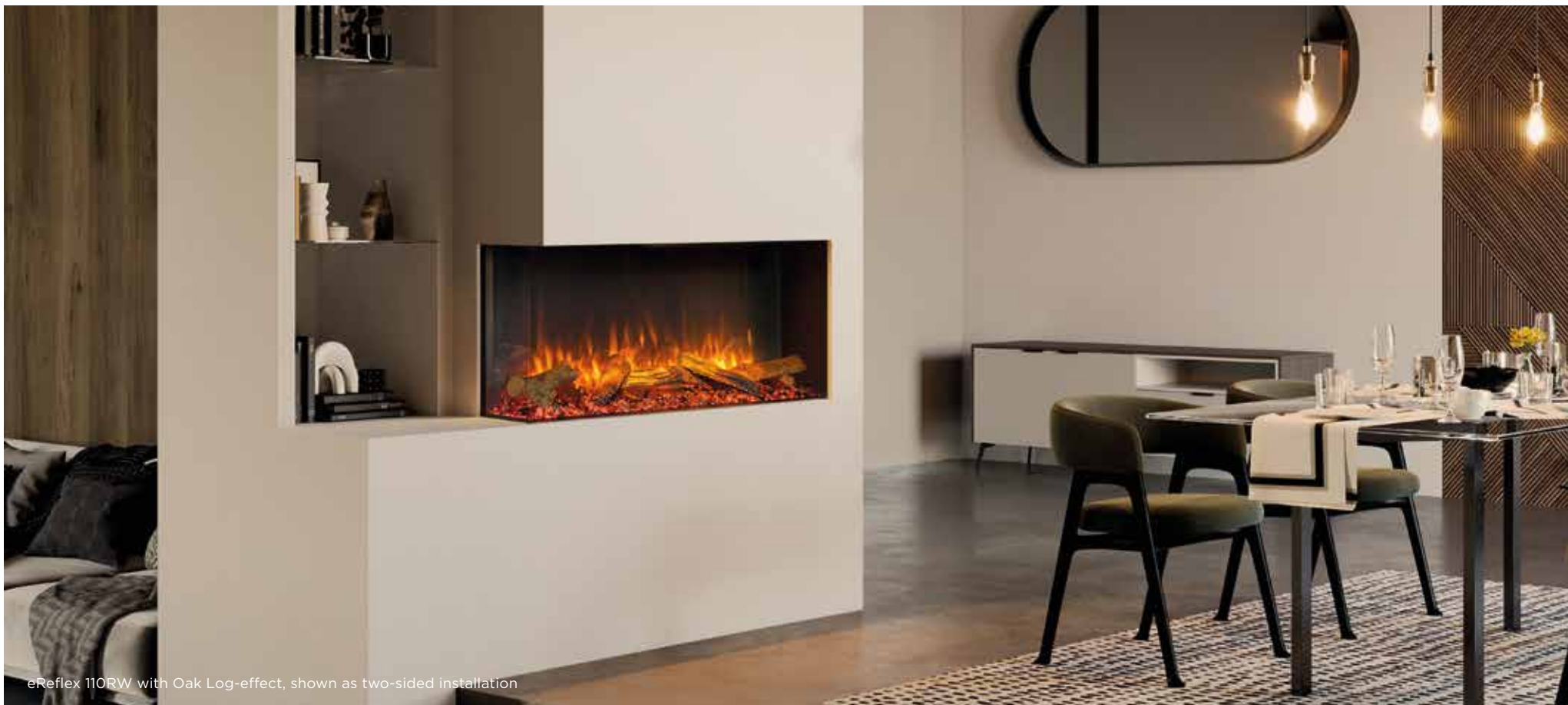
eReflex 110RW with Oak Log-effect, shown as two-sided installation