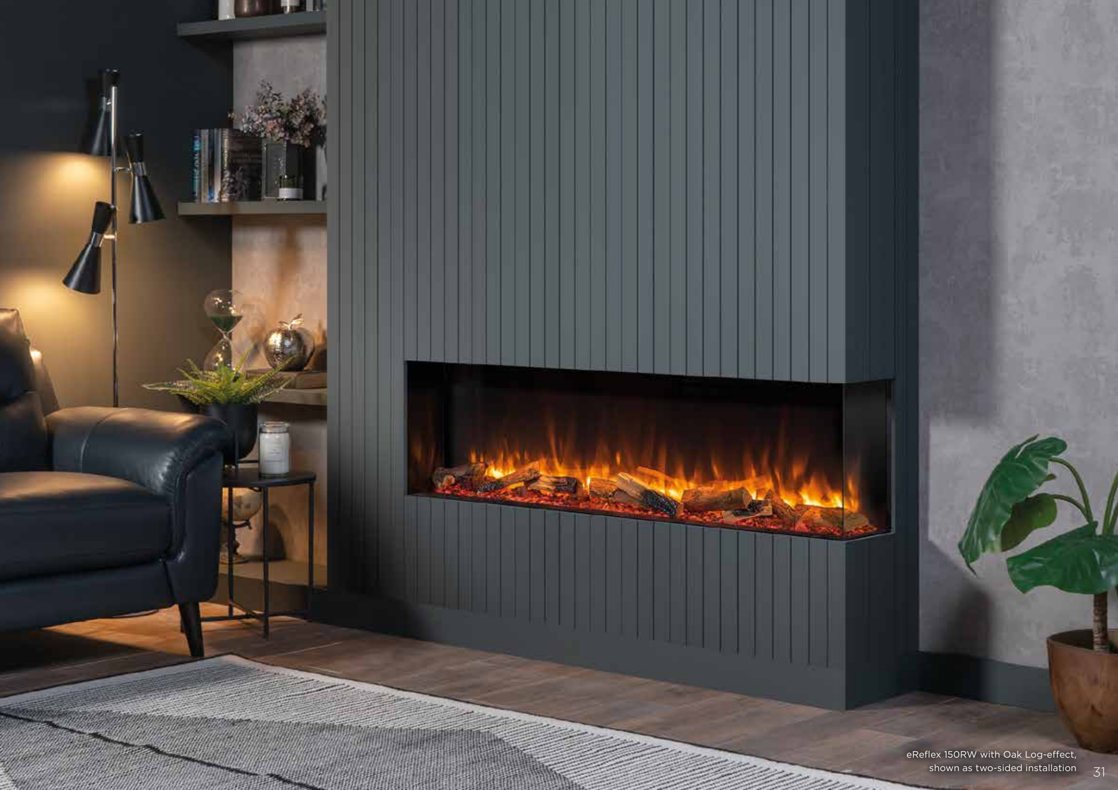
eReflex 150RW with Oak Log-effect, shown as two-sided installation