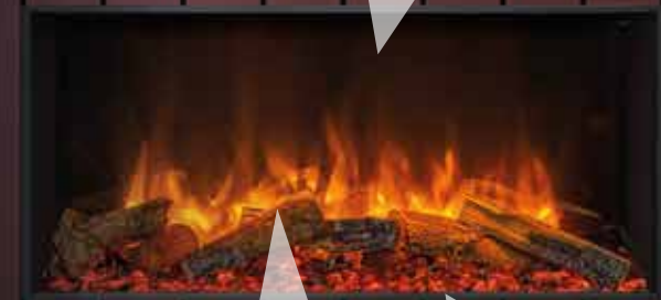
Selection of 8 fuel bed lighting colours, plus spectrum mode