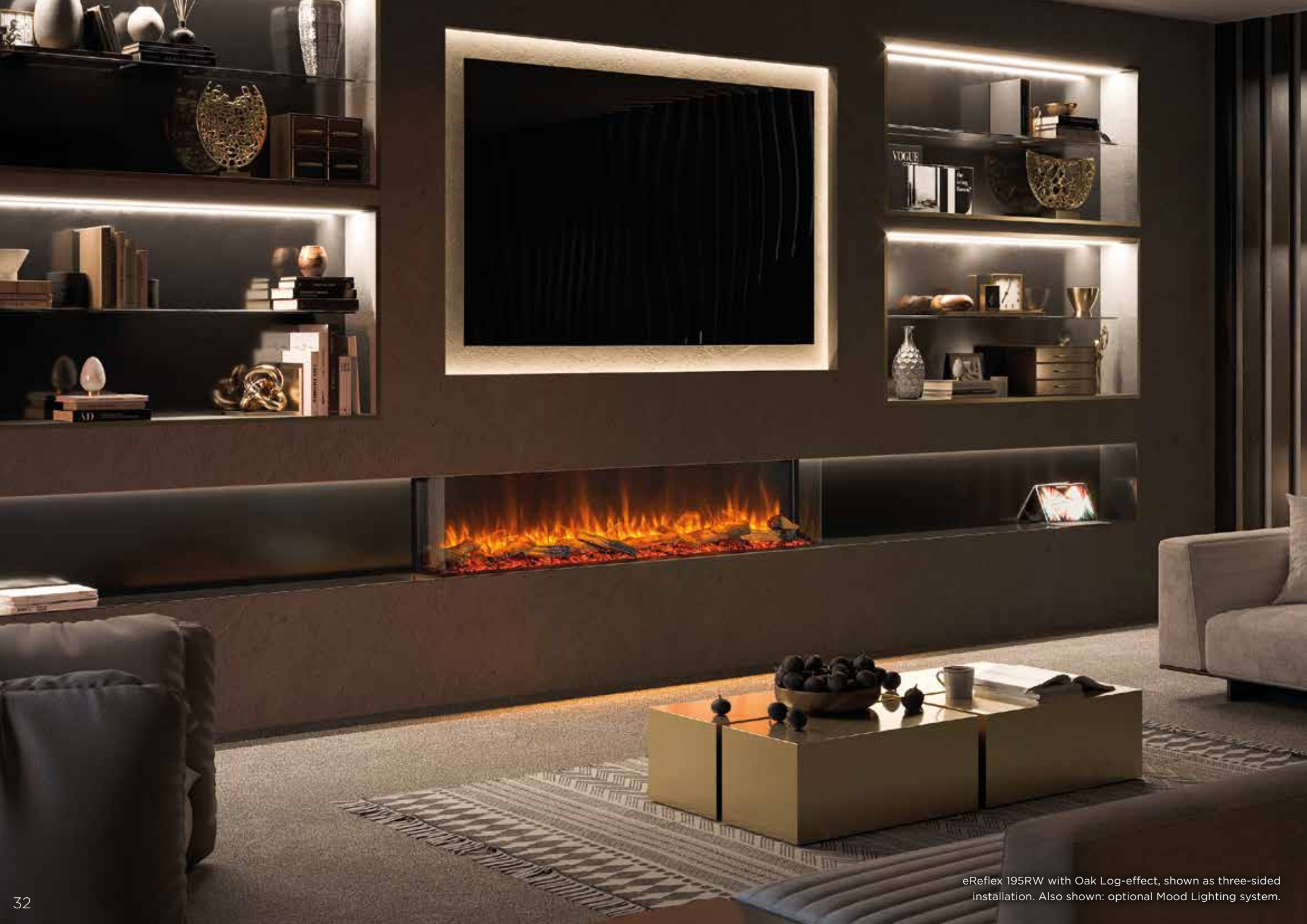
eReflex 195RW with Oak Log-effect, shown as three-sided installation. Also shown: optional Mood Lighting system.