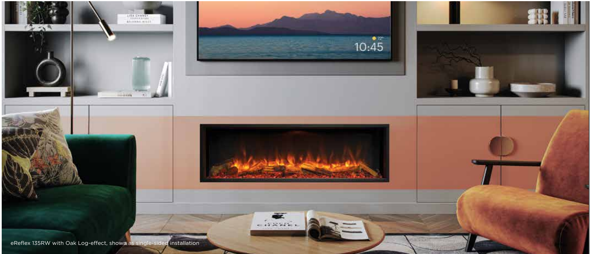
eReflex 135RW with Oak Log-effect, shown as single-sided installation