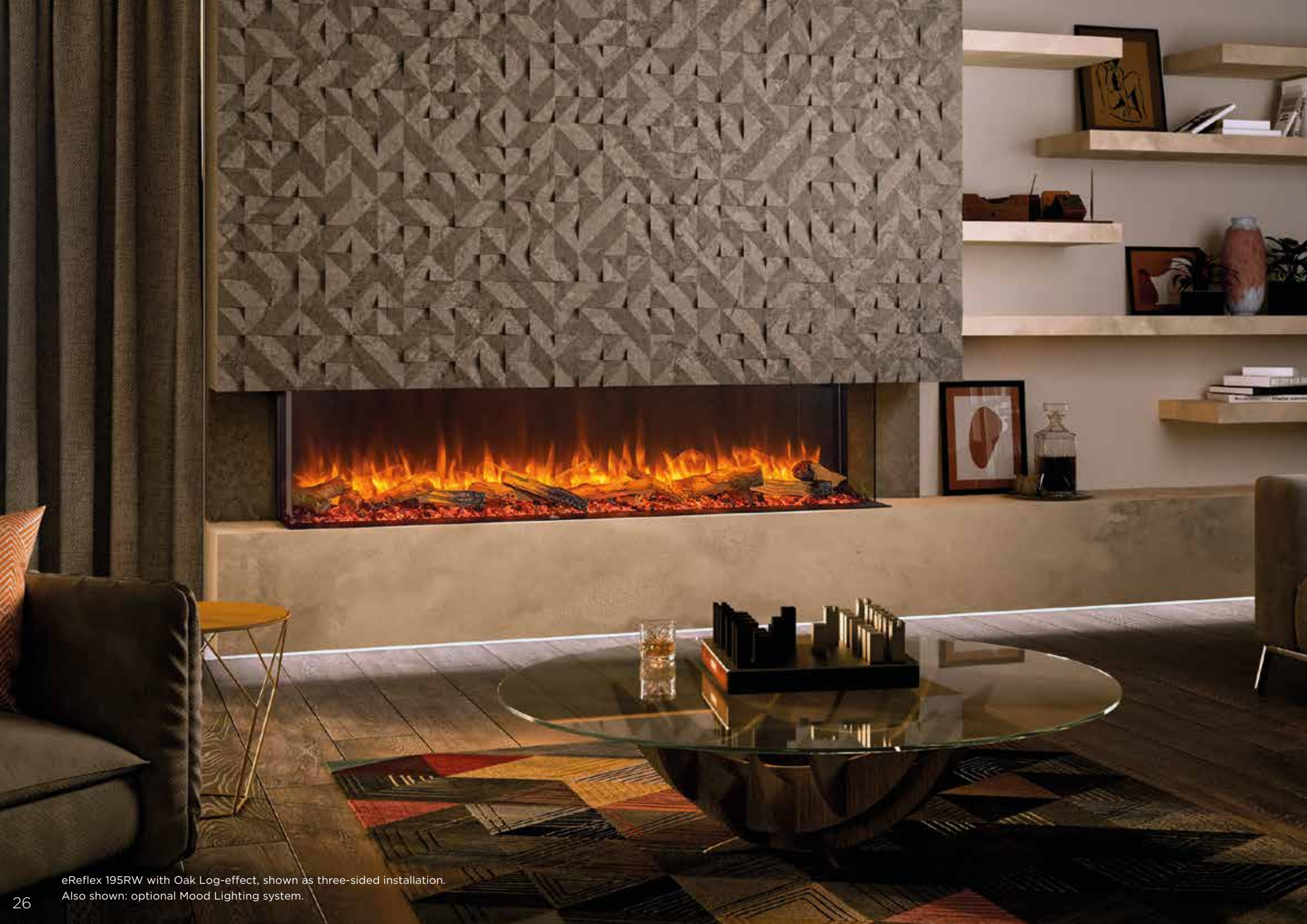
eReflex 195RW with Oak Log-effect, shown as three-sided installation. Also shown: optional Mood Lighting system.