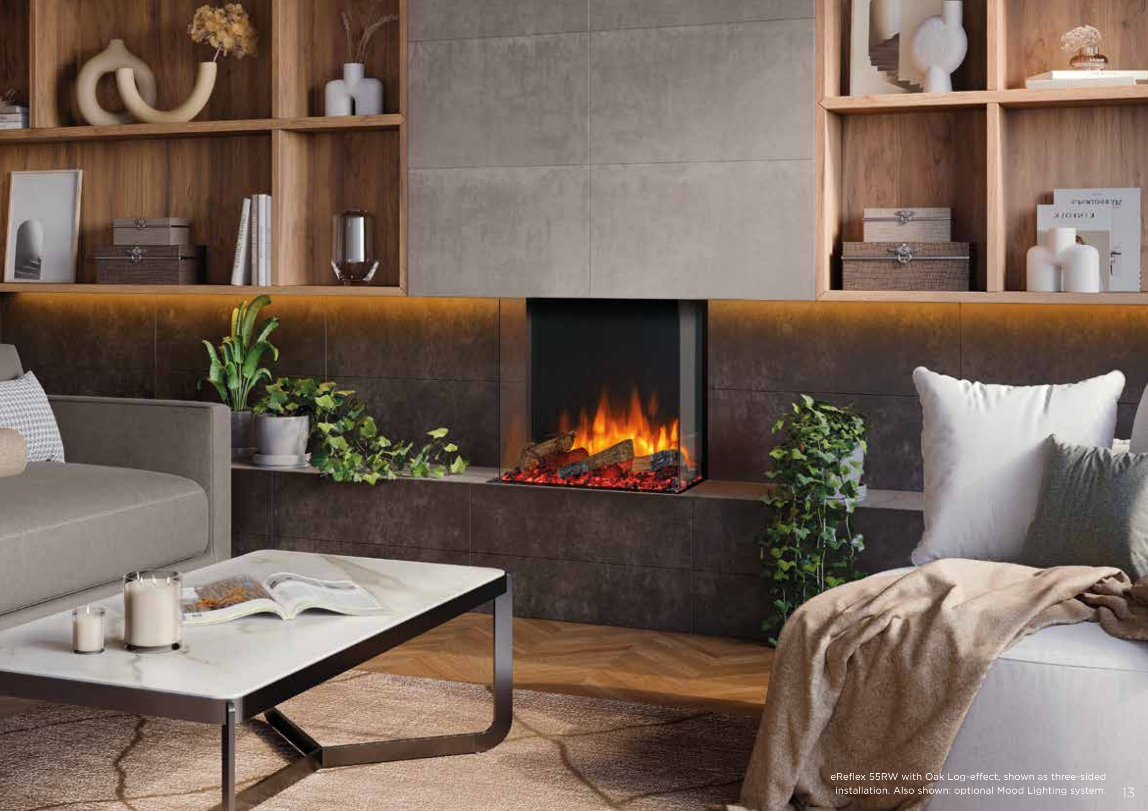
eReflex 55RW with Oak Log-effect, shown as three-sided installation. Also shown: optional Mood Lighting system.