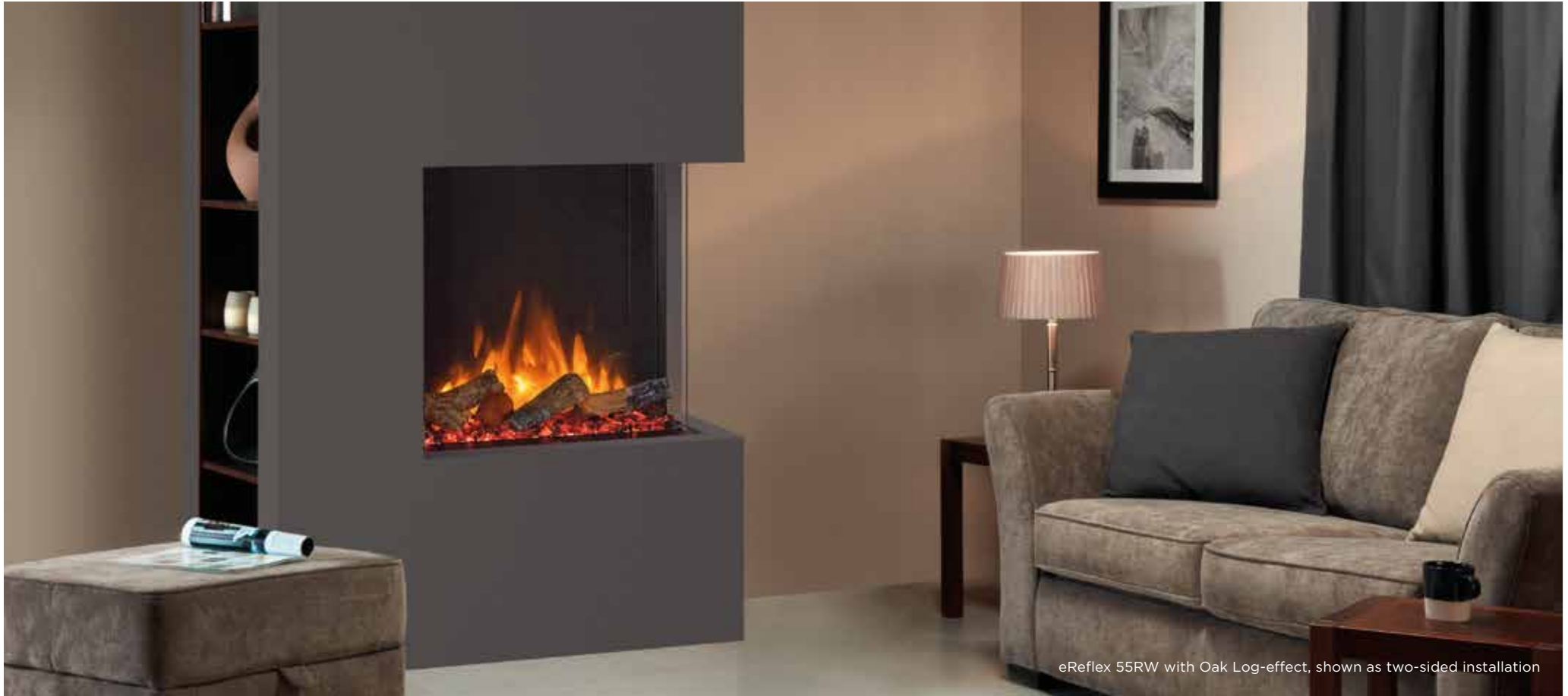
eReflex 55RW with Oak Log-effect, shown as two-sided installation