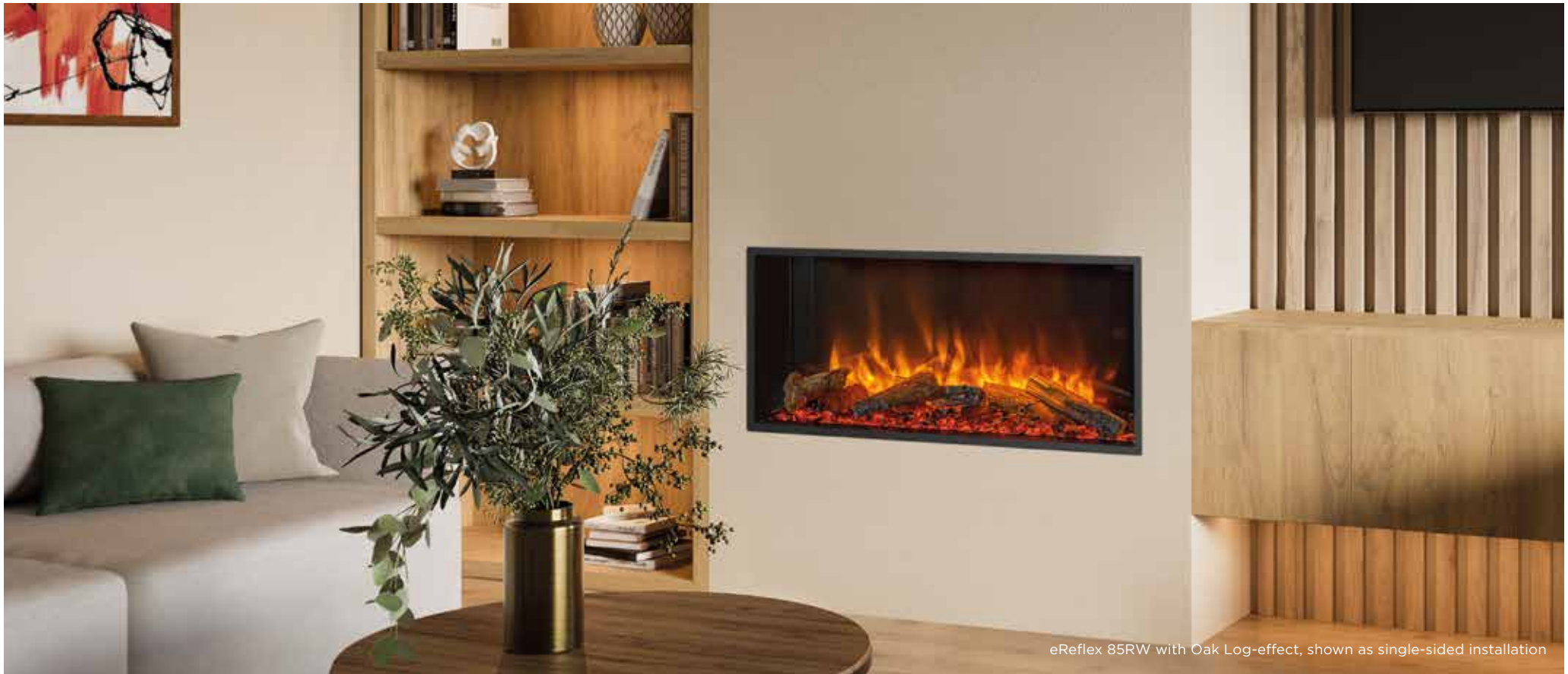
eReflex 85RW with Oak Log-effect, shown as single-sided installation