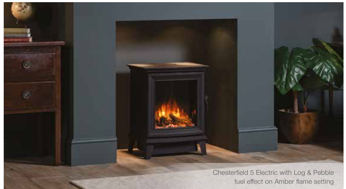
Chesterfield 5 Electric with Log & Pebble fuel effect on Amber flame setting