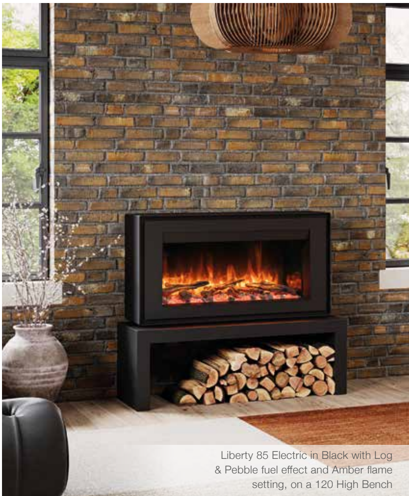
Liberty 85 Electric in Black with Log & Pebble fuel effect and Amber flame setting, on a 120 High Bench

We're proud to offer an extensive electric portfolio, including a number of eye-catching stoves in both traditional and contemporary designs, and the easy-fit eStudio Arosa and Cerreto electric ranges, which create a stunning centrepiece with no building work required. Whatever your requirements, Gazco has the perfect solution to suit your style and budget. Ask your local retailer for more information or download our brochures from www.gazco.com .