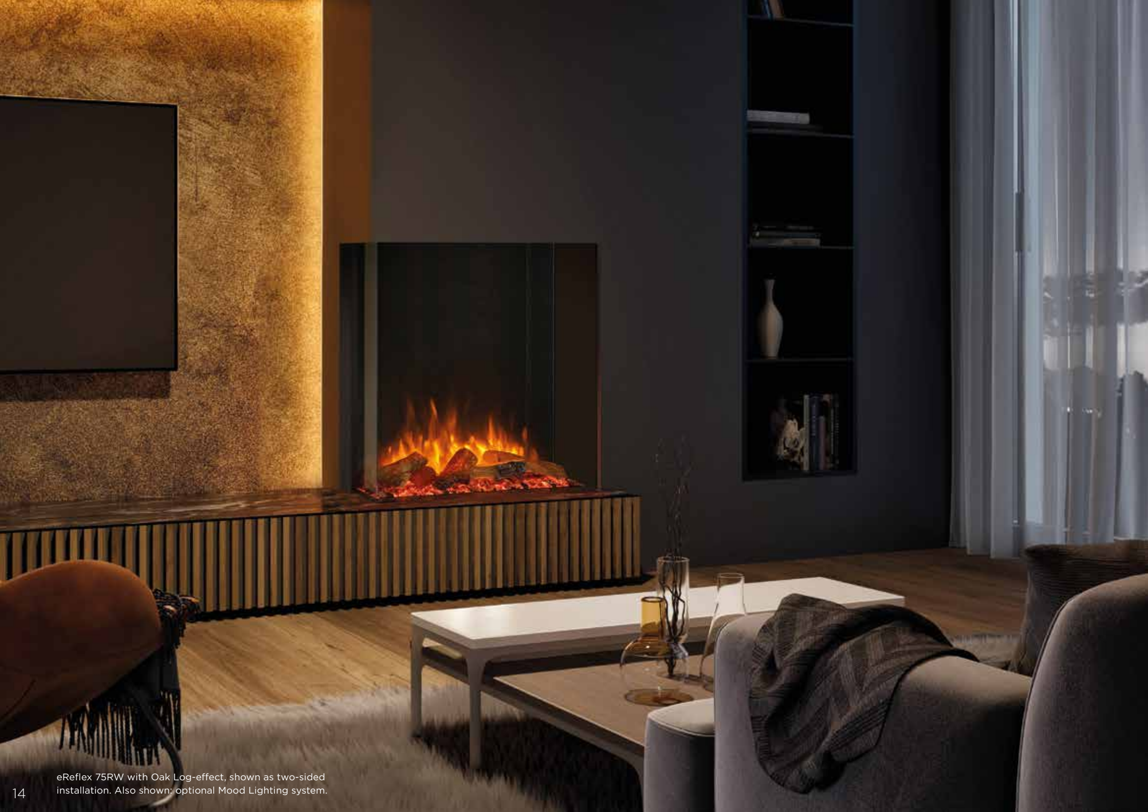
eReflex 75RW with Oak Log-effect, shown as two-sided installation. Also shown: optional Mood Lighting system.