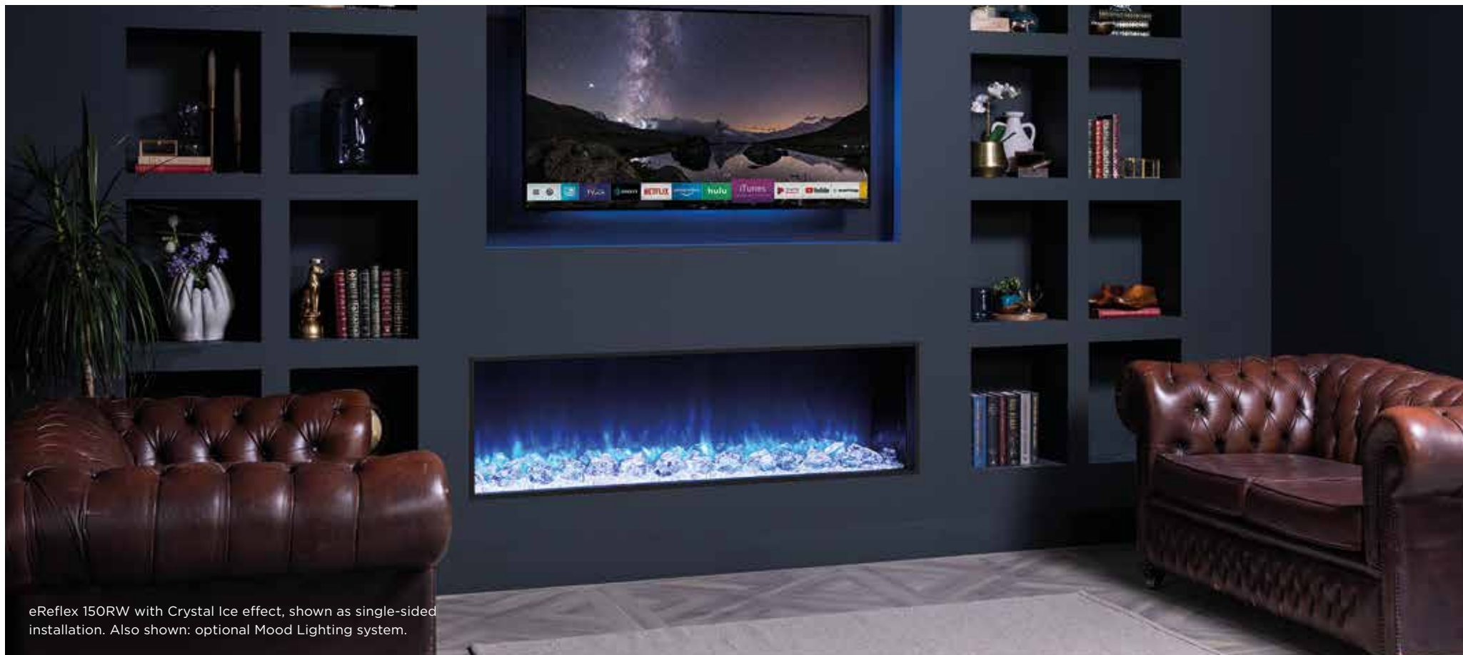
eReflex 150RW with Crystal Ice effect, shown as single-sided installation. Also shown: optional Mood Lighting system.