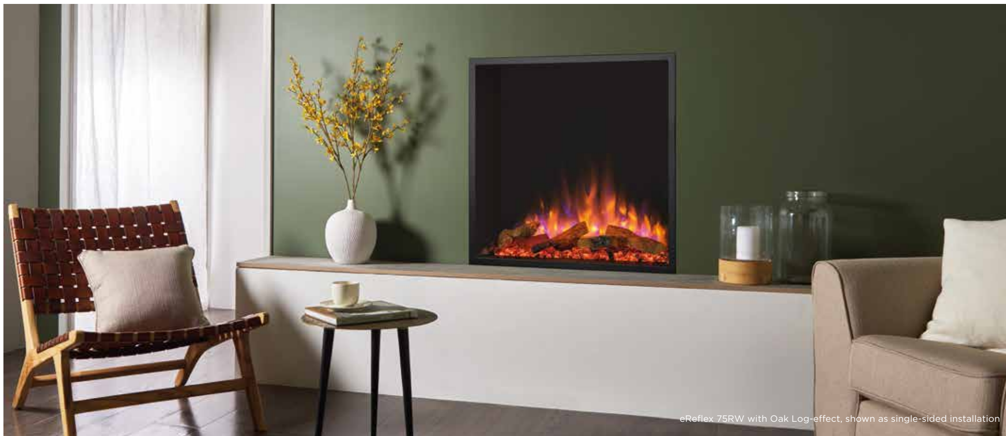
eReflex 75RW with Oak Log-effect, shown as single-sided installation