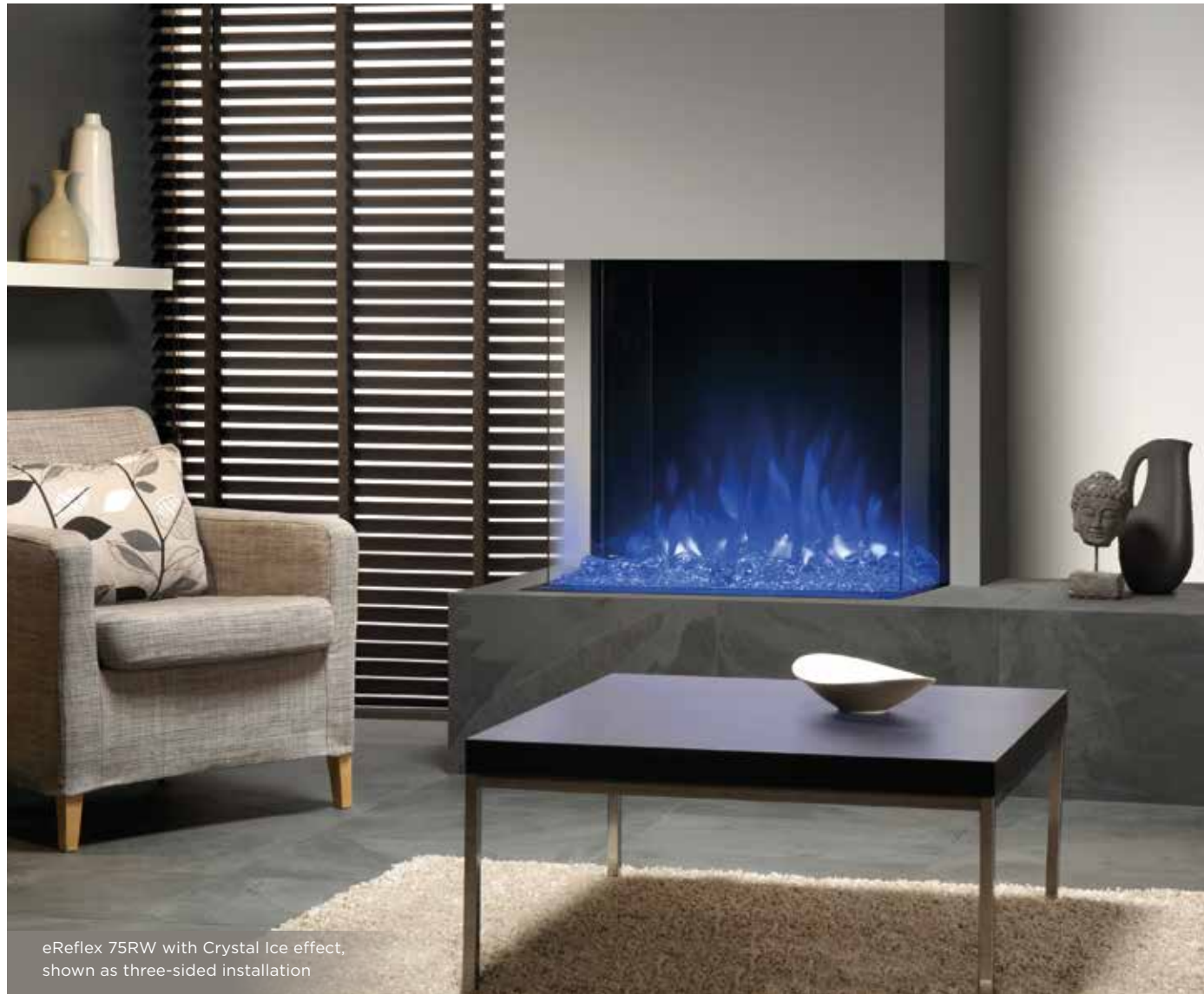
eReflex 75RW with Crystal Ice effect, shown as three-sided installation

Single, left or right corner, and three-sided options – all from one fire