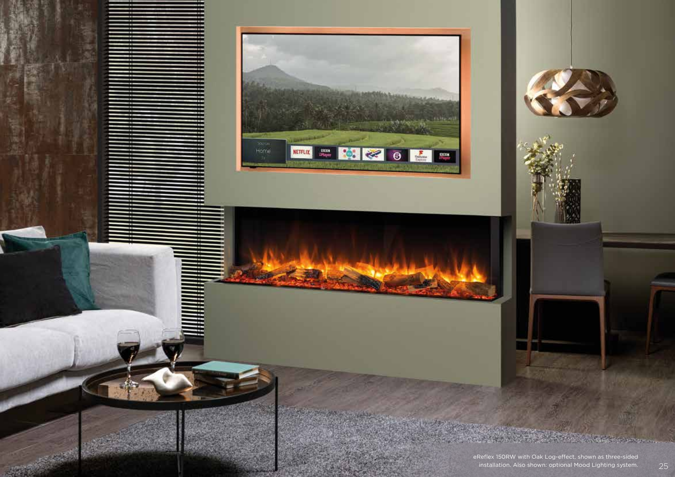
eReflex 150RW with Oak Log-effect, shown as three-sided installation. Also shown: optional Mood Lighting system.