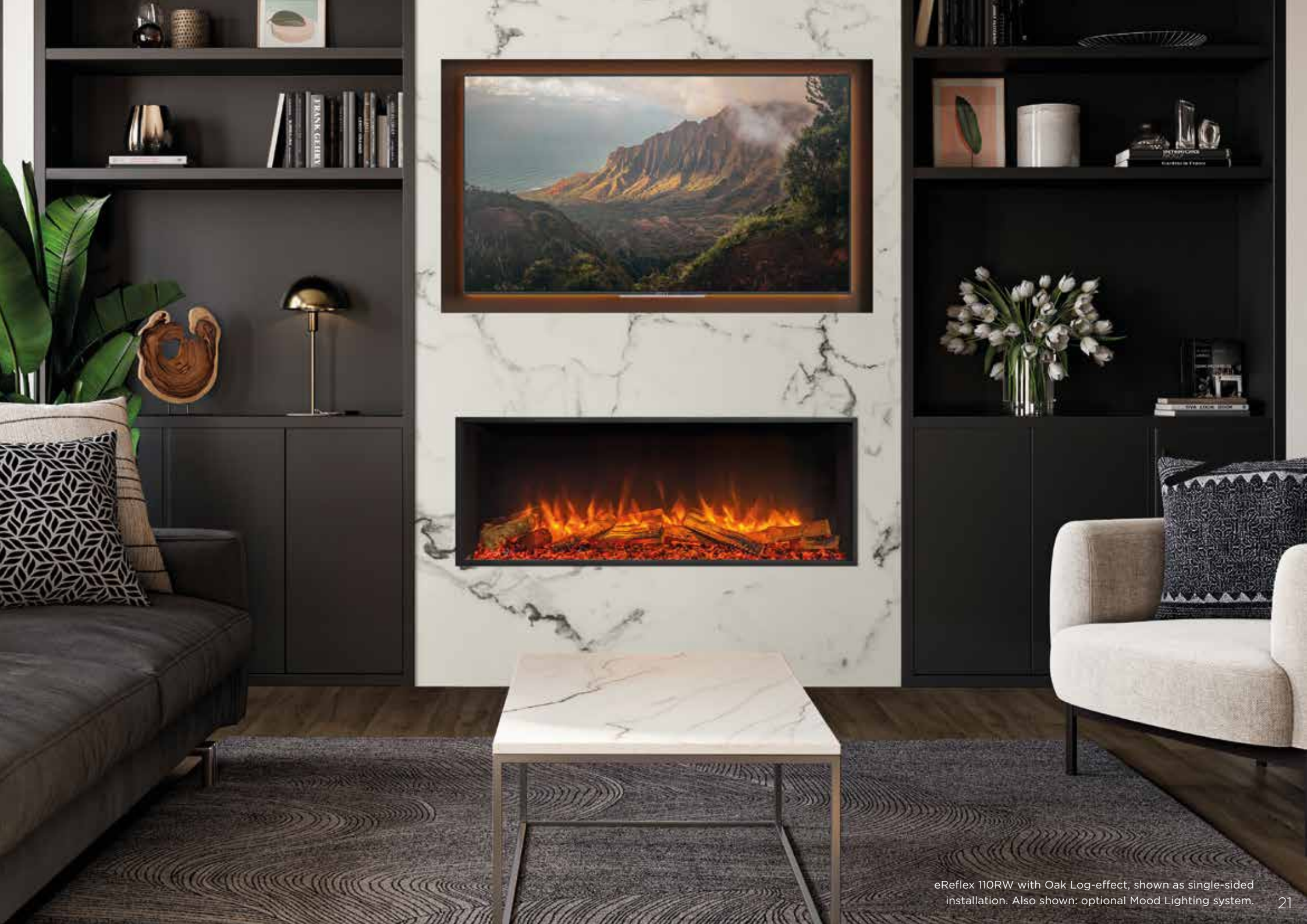
eReflex 110RW with Oak Log-effect, shown as single-sided installation. Also shown: optional Mood Lighting system.