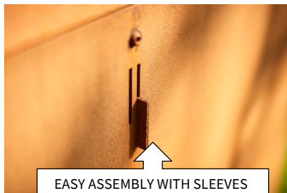
EASY ASSEMBLY WITH SLEEVES AND STRIPS

It is a stylish, durable and well thought-out outdoor furniture that can be given a prominent and visible place in your garden!