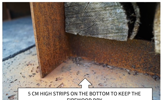
5 CM HIGH STRIPS ON THE BOTTOM TO KEEP THE FIREWOOD DRY