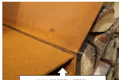
3MM CORTEN STEEL