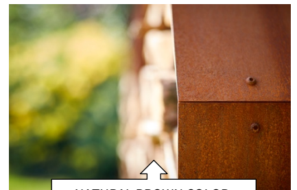
NATURAL BROWN COLOR