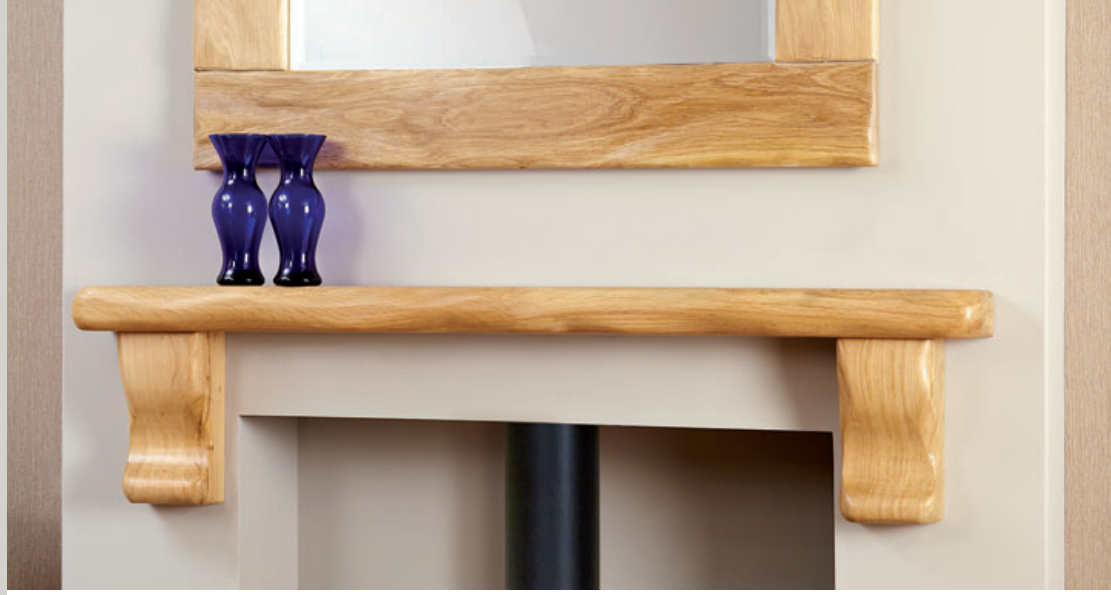
Large Shelf with Corbels: Dressed Oak in a Natural Waxed Finish Beam Mirror: Dressed Oak in a Natural Waxed Finish