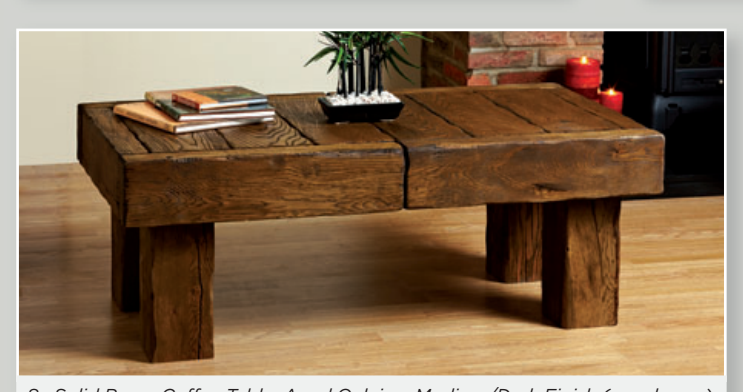
8. Solid Beam Coffee Table: Aged Oak in a Medium/Dark Finish (very heavy)