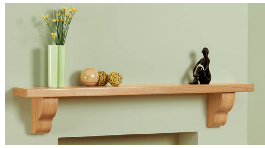
Traditional Shelf: Waxed Oak