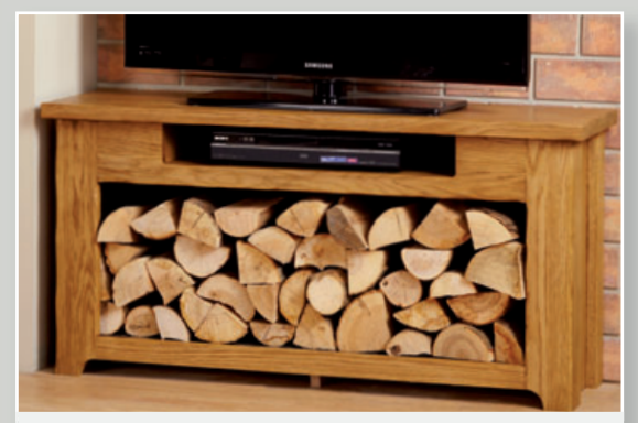
1. TV Unit with Log Store: Rustic Oak in a Light/Medium Finish