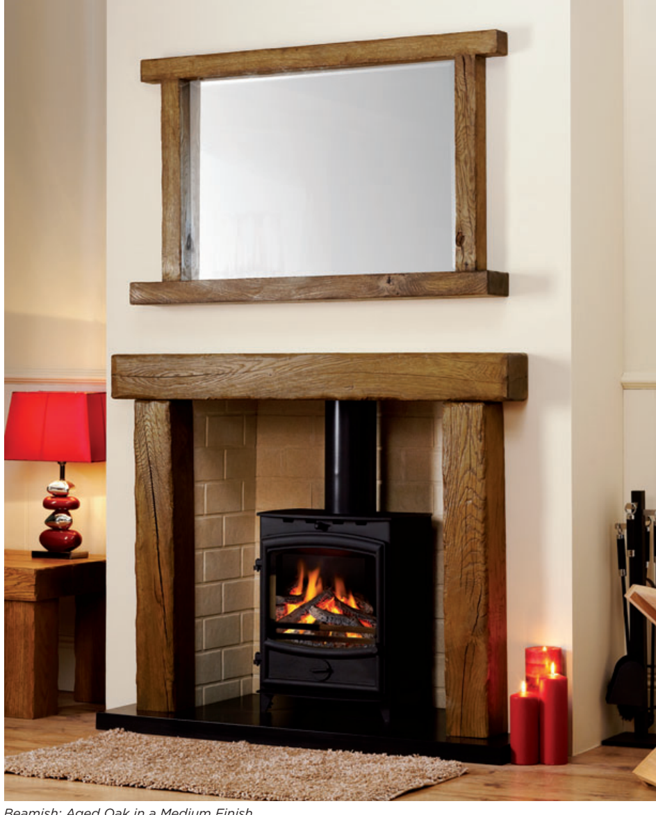
Beamish: Aged Oak in a Medium Finish Beamish Mirror: Aged Oak in a Medium Finish