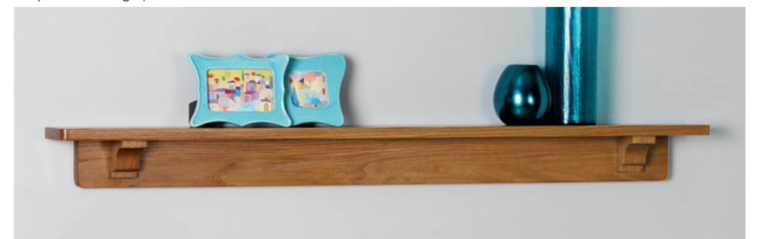
Morpeth Shelf: Light/Medium Oak