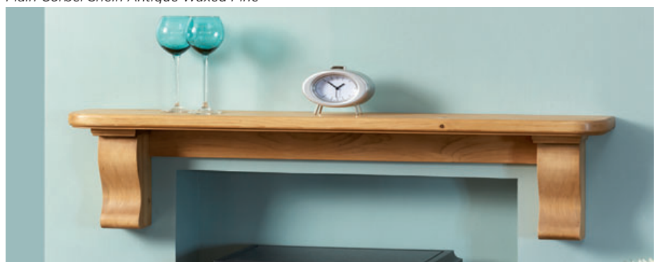
Plain Corbel Shelf: Antique Waxed Pine