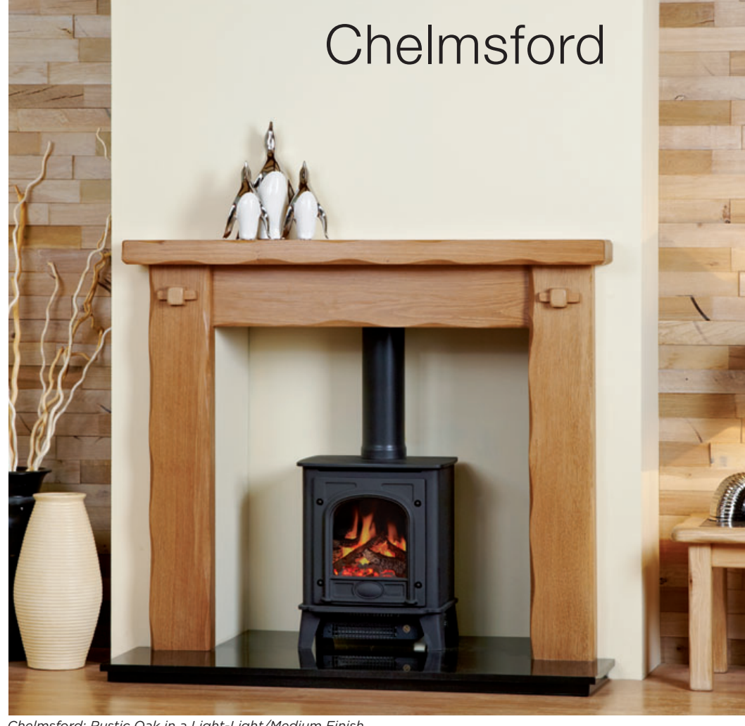
Chelmsford: Rustic Oak in a Light-Light/Medium Finish

The Chelmsford and Chatham are substantial surrounds produced from four pieces of Kiln-dried Oak. These designs can easily be made to your specific dimensions.