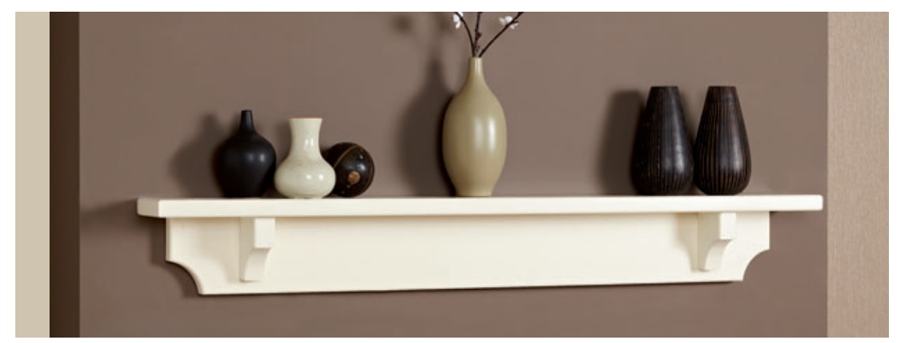
Aberdeen Shelf: Antique White Finish