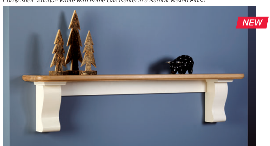
Corby Shelf: Antique White with Prime Oak Mantel in a Natural Waxed Finish