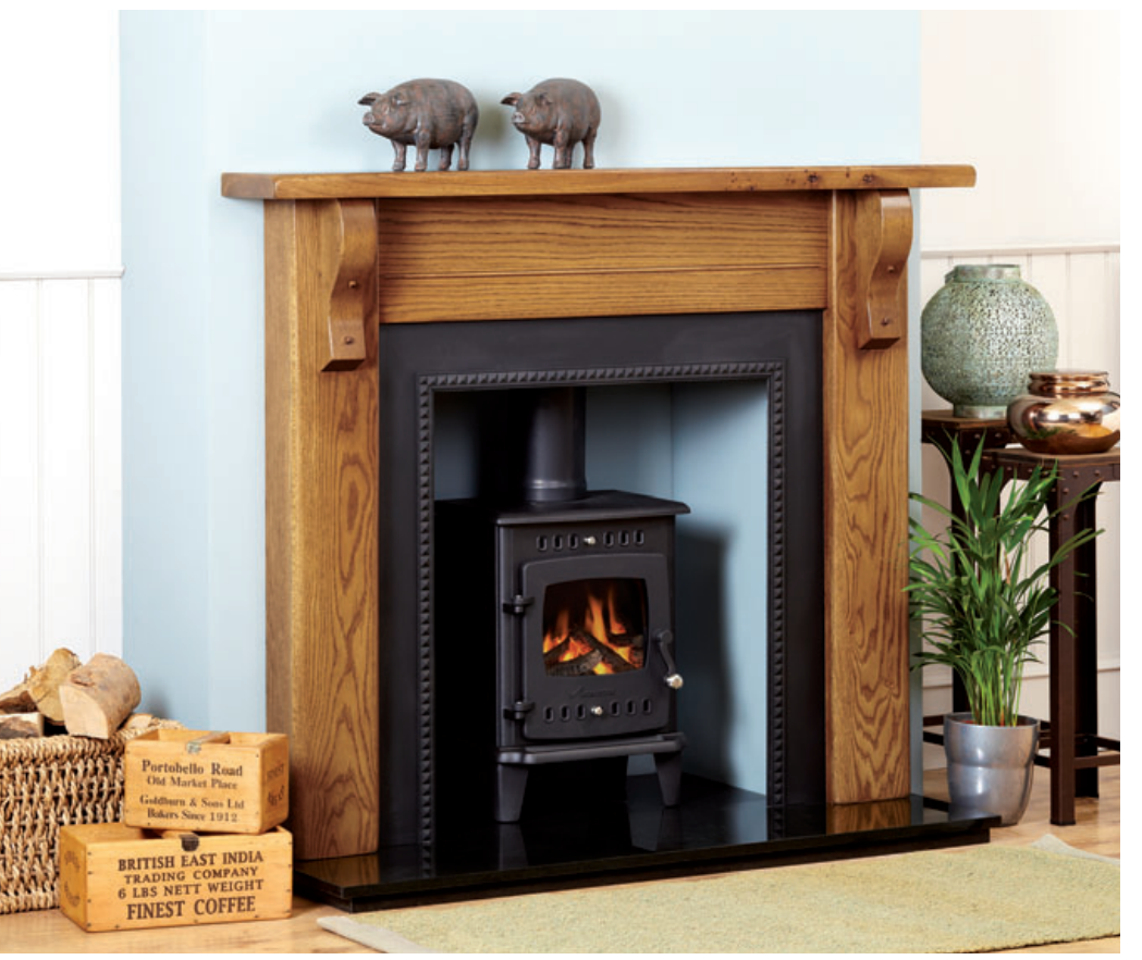
Cropton: Rich Oak