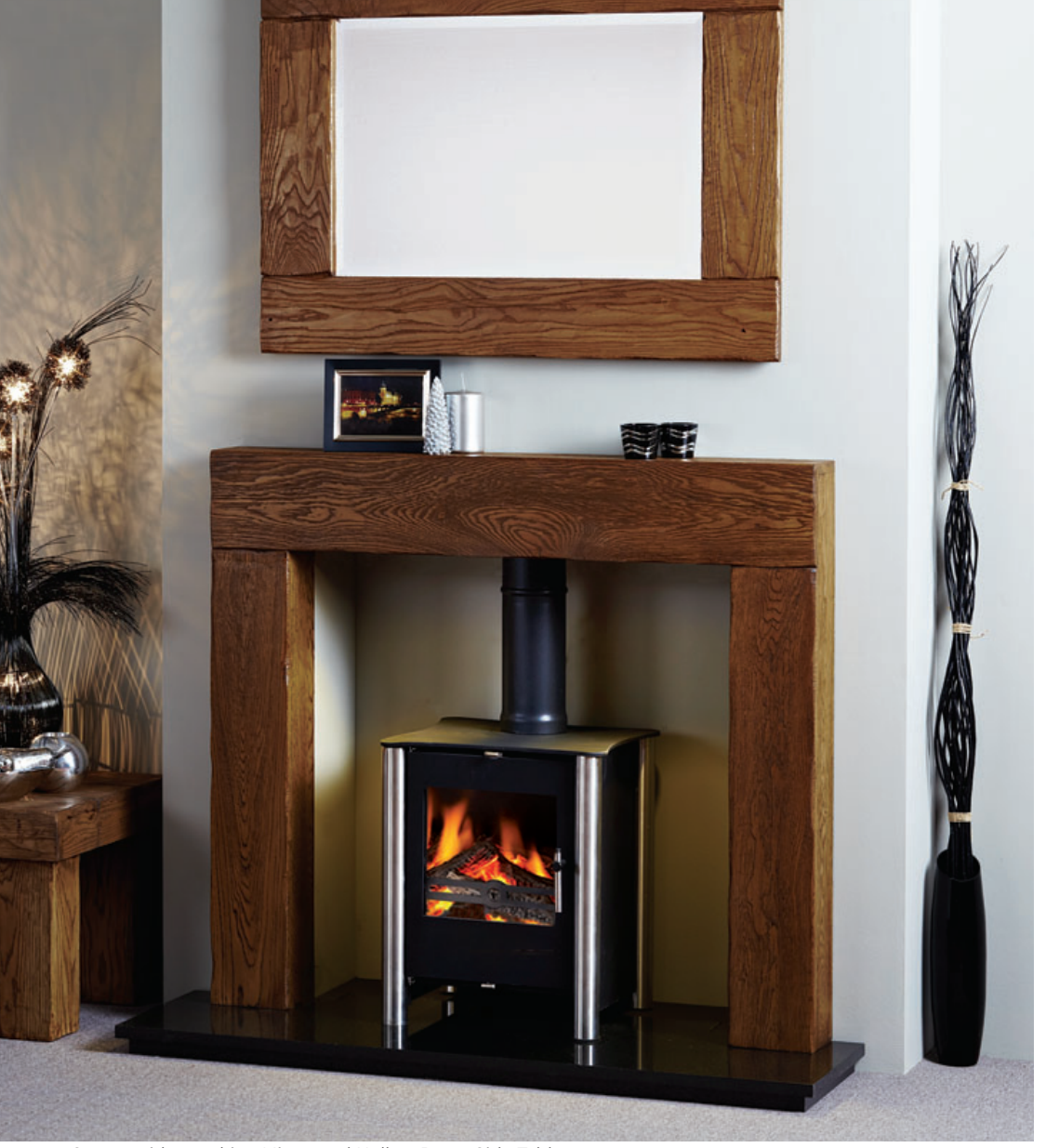
Sutton with matching Mirror and Hollow Beam Side Table Aged Oak in a Medium/Dark Finish