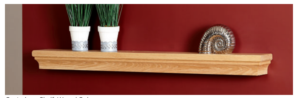
Canterbury Shelf: Waxed Oak