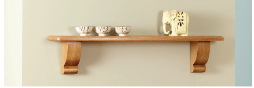
Curved Shelf: Light Oak