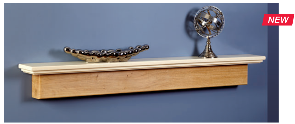
Oban Shelf: Round Edge Oak in a Natural Waxed Finish with Mantel in Soft Cream