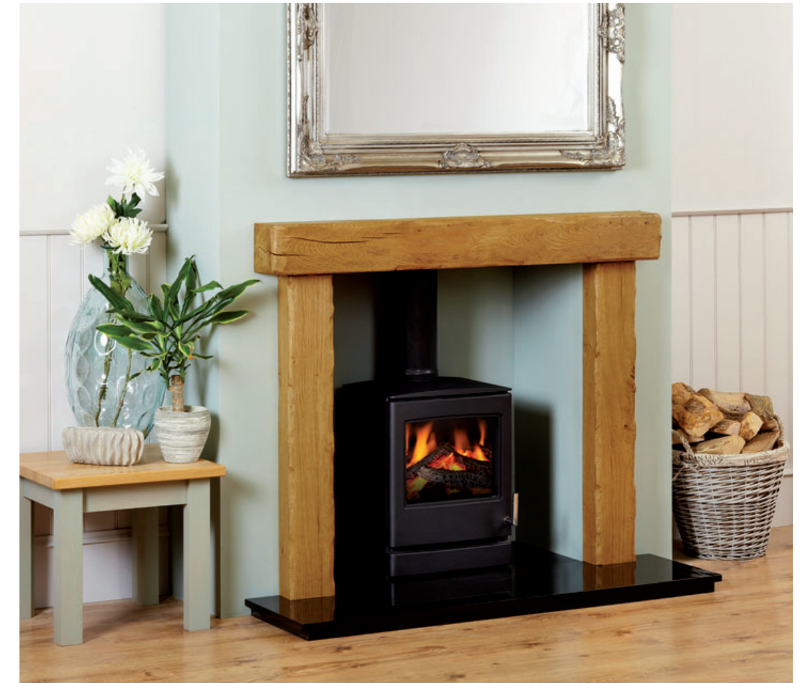
Barlby: Rustic Oak in a Light/Medium Finish