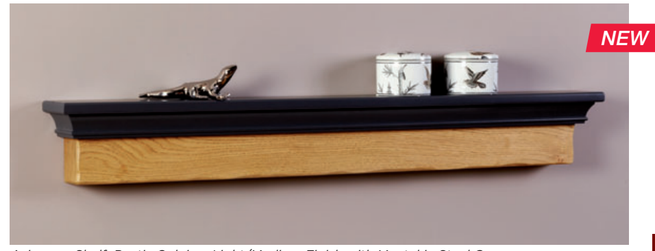
Aviemore Shelf: Rustic Oak in a Light/Medium Finish with Mantel in Steel Grey