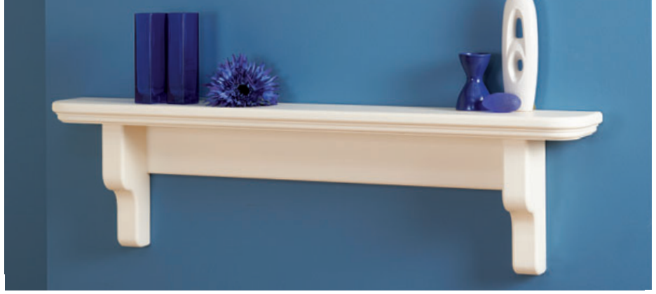
Long Corbel Shelf: Antique White Finish