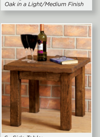
6. Side Table: Aged Oak in a Medium Finish