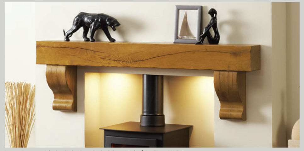
Deep Beam with Corbels: Rustic Oak in a Light/Medium Finish