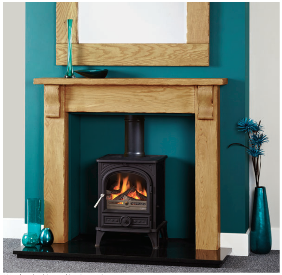
Woodstock with matching Beam Mirror Aged Oak in a Light/Medium Finish