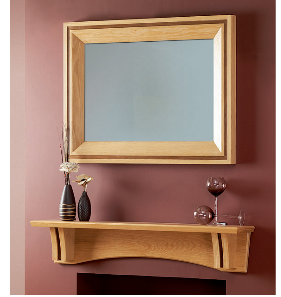
Matlock Shelf and Matlock Mirror: Light Oak with Walnut Detail