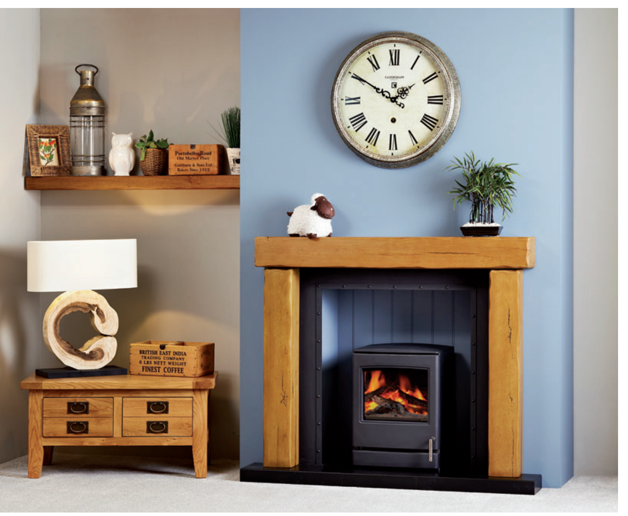
Beamish: Rustic Oak in a Light/Medium Finish