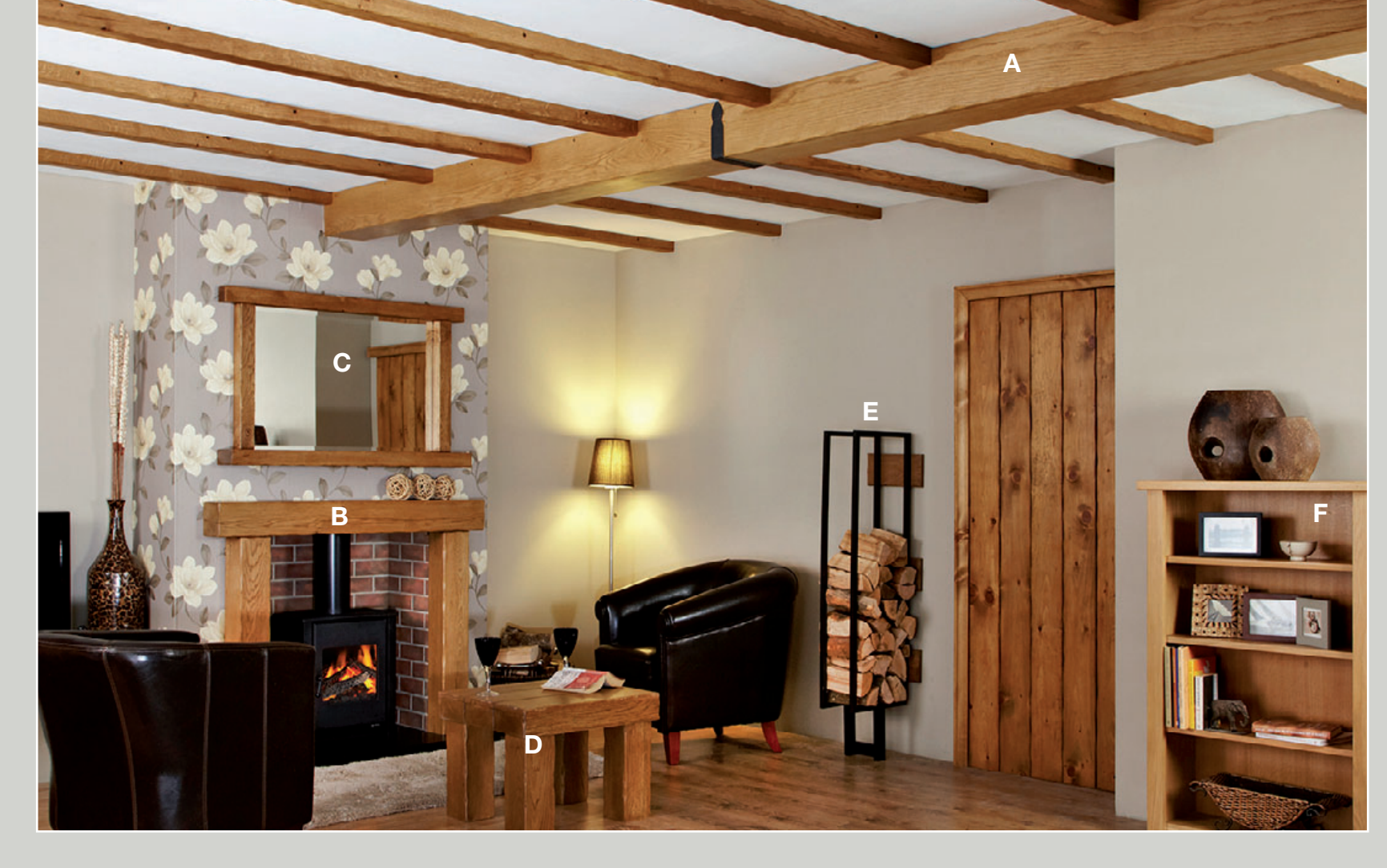
Steel Beam Cover: Aged Oak in a Silvered Finish