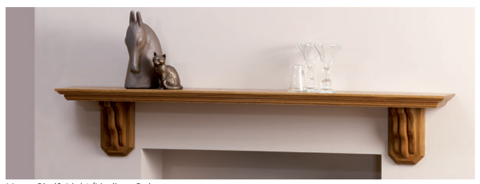
Vyner Shelf: Light/Medium Oak