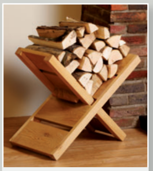
4. Log Holder: Oak in a Waxed Finish