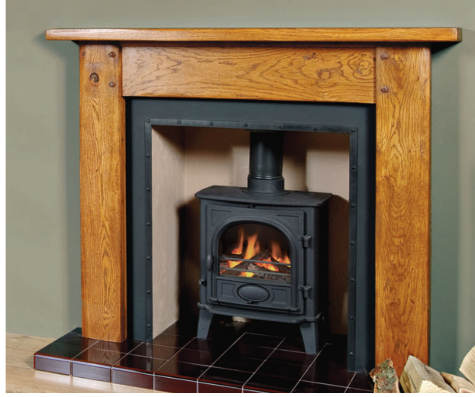
Gainsborough: Brushed Oak in a Golden Finish