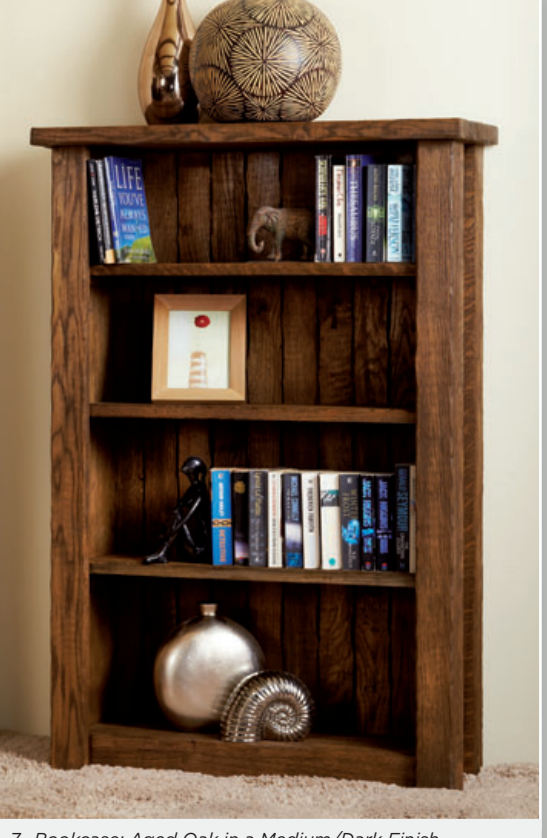
7. Bookcase: Aged Oak in a Medium/Dark Finish

What could be more ideal than choosing some occasional furniture that matches your fireplace or beam?