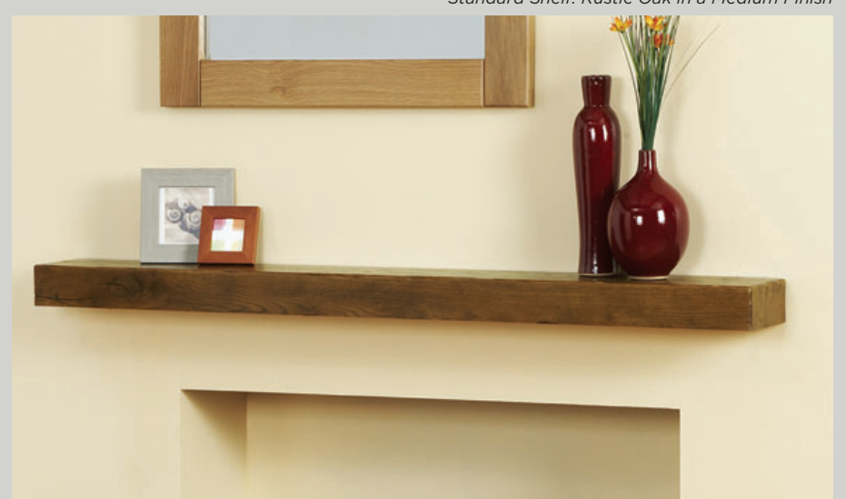
Standard Shelf: Rustic Oak in a Medium Finish

All the Floating Shelves above can be combined with a set of Corbels.