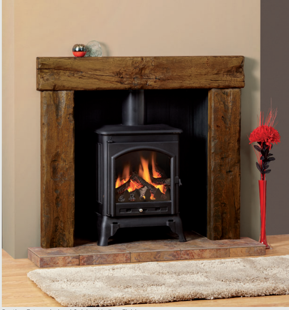
Bentley: Extremely Aged Oak in a Medium Finish