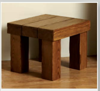
9. Hollow Beam Side Table: Rustic Oak in a Medium Finish