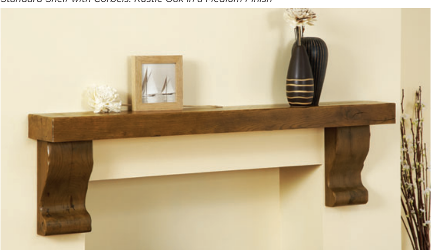
Standard Shelf with Corbels: Rustic Oak in a Medium Finish