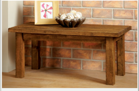
2. Coffee Table: Aged Oak in a Medium Finish

3. TV Unit: Prime Oak in a Natural Waxed Finish