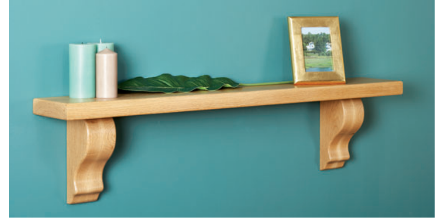
Classical Shelf: Waxed Oak