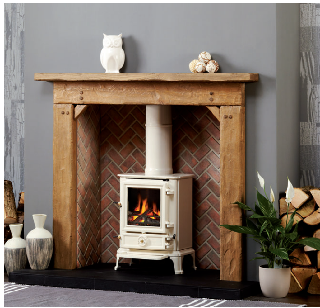
Barkston: Extremely Aged Oak in a Light/Medium Finish